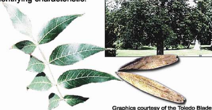
Graphics courtesy of the Toledo Blade

Habitat: Dry upland limestone sites. Features: Twigs that appear to be square. The wings that grow on the twigs give the tree its square twig identifying characteristic.